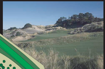
pacific dunes bandon, oregon